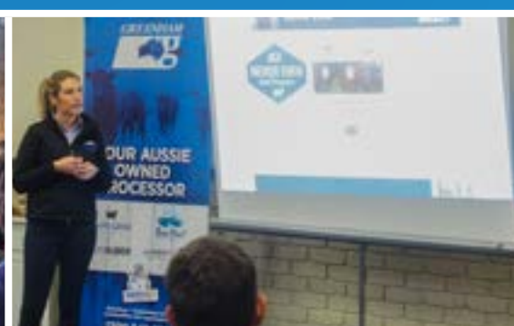
The Greenham team will be holding more producer days as we ramp up production of quality cattle at the meatworks.